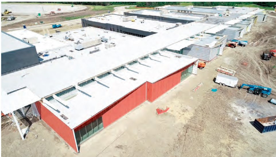
Washburn Rural North Middle School

A comprehensive assessment of school capacity and configuration revealed a significant opportunity to improve the student experience by constructing a second middle school. Transitioning from one middle school serving over 1,000 seventh- and eighth-grade students to two appropriately sized middle schools, each serving just over 600 sixth-, seventh-, and eighth-graders, will better meet our students' needs. Located on the northeast corner of 29th Street and Auburn Road, Washburn Rural North Middle School will open for the 2025-2026 school year. The 140,000-sq. ft. building is being built with a focus on teaming and collaboration.