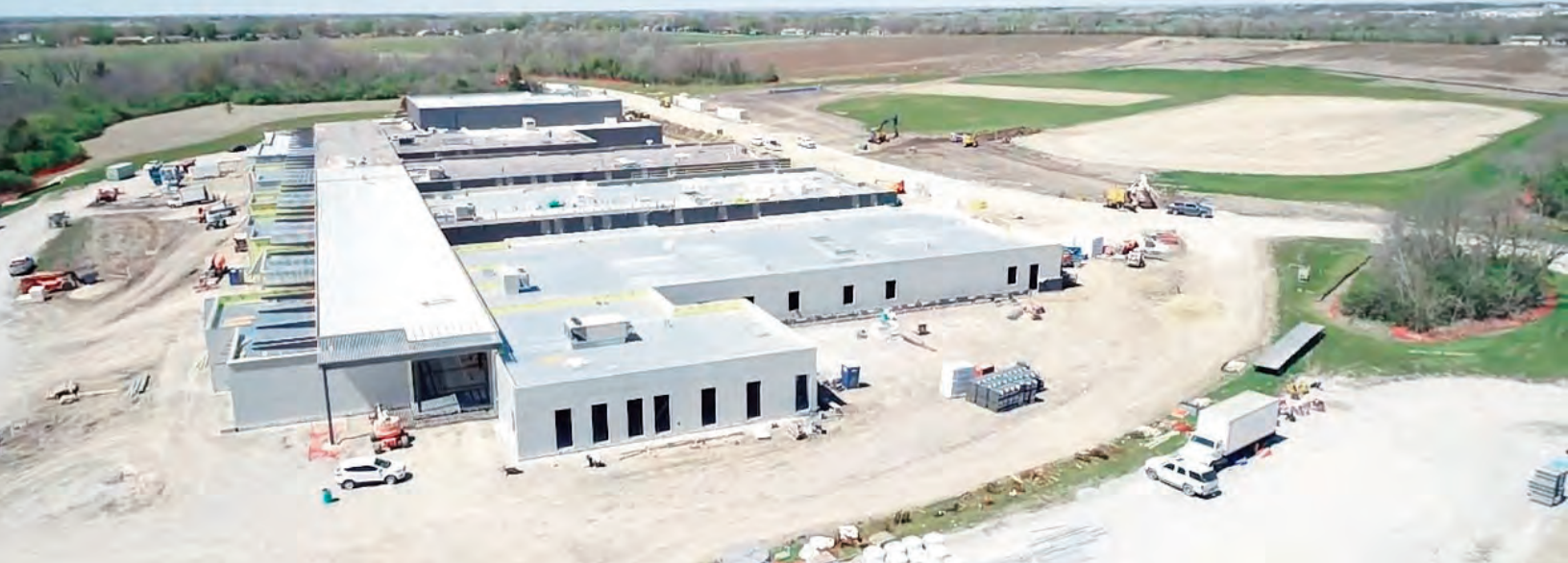
Washburn Rural North Middle School