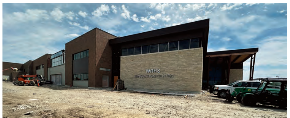
The Innovation Center at Washburn Rural High School

Beyond the Innovation Center, the high school is undergoing renovations to many existing classrooms as well as the addition of a multipurpose activity center that will expand teaching and learning spaces during the day and offer practice and training opportunities after hours.