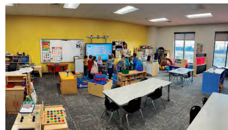
Pauline Central Primary School